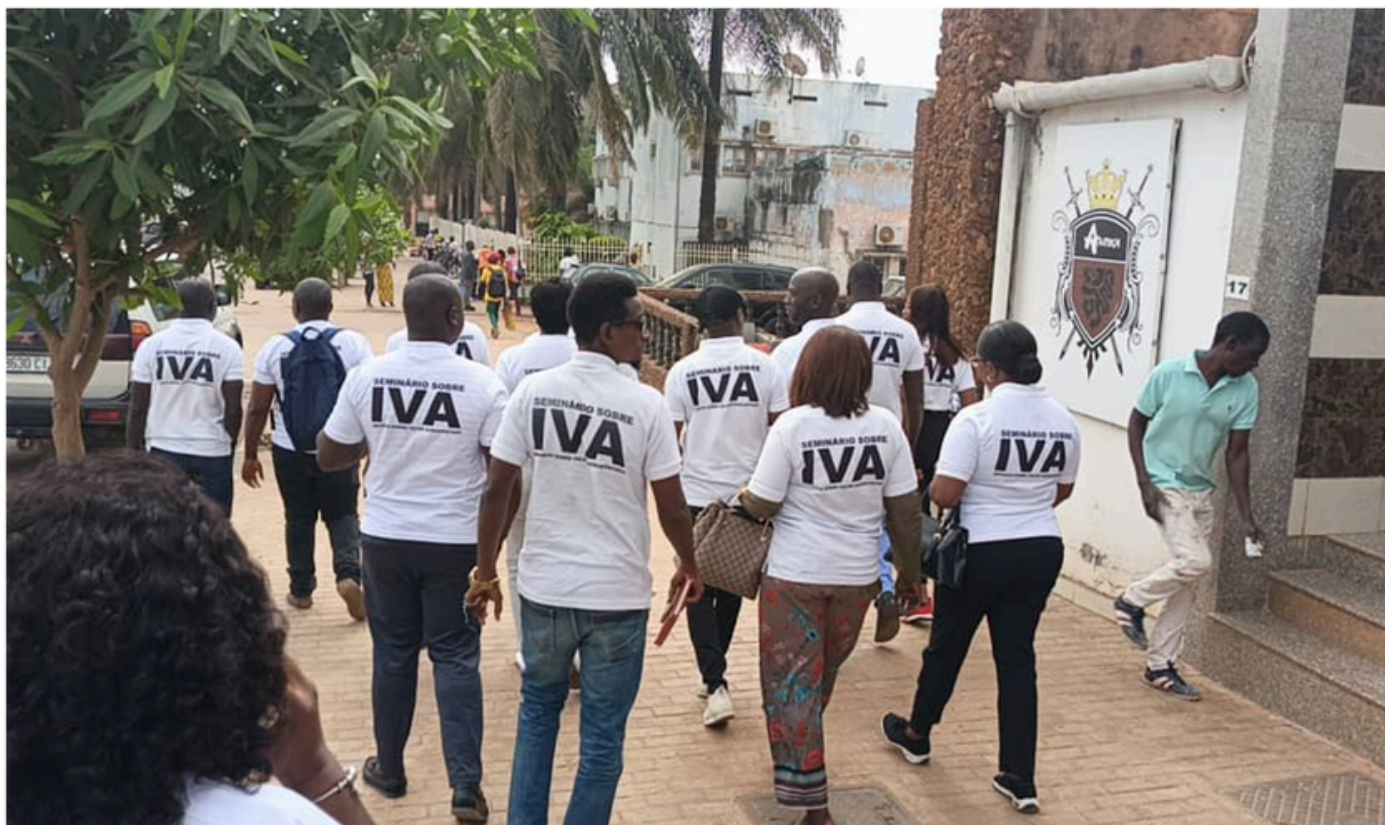
Above: Public sensitisation in action during the final day of the training.