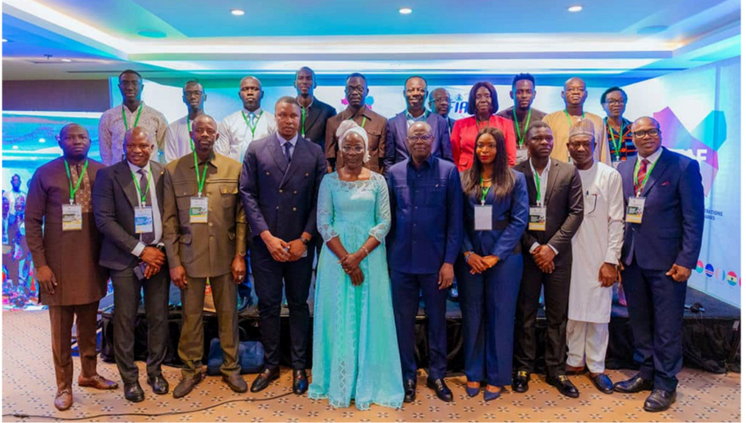
Group photo from the opening ceremony

The 2025 WATAF Country Correspondents Conference was held from 18–19 March, in Abuja, Nigeria, bringing together 33 communication professionals and technical experts from across nine West African tax administrations and the Federal Inland Revenue Service (FIRS). The two-day event underscored the critical role of strategic communication in strengthening tax systems, boosting public trust, and supporting institutional development.