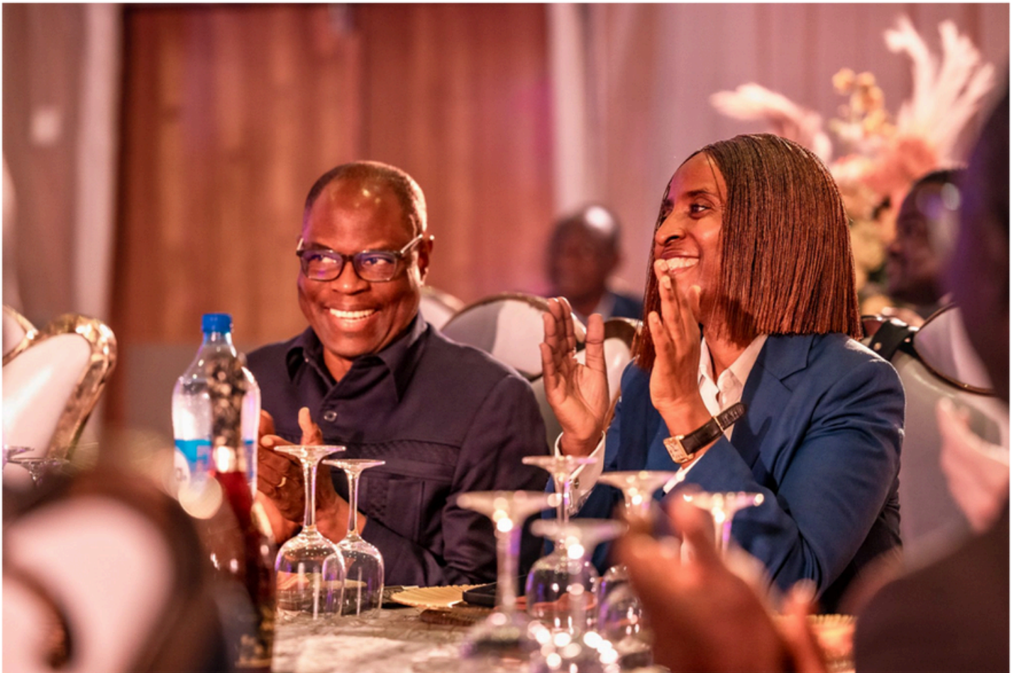
Award Night photos