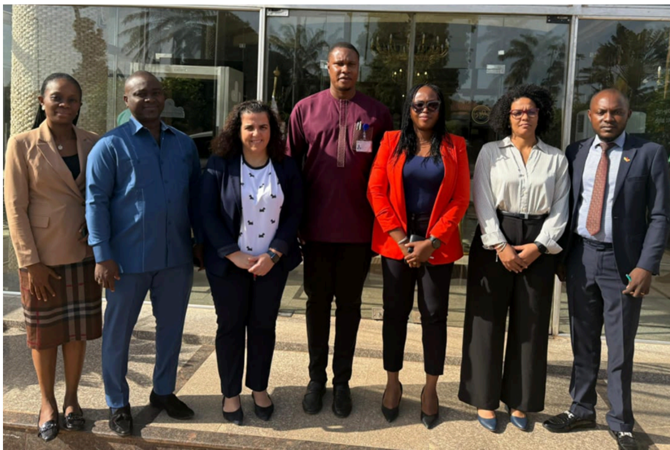
Above: DG, DGCI with the Trainers and WATAF Staff

In a landmark step toward reforming its tax system, Guinea-Bissau officially rolled out Value Added Tax (VAT) on 1 January 2025. To support this major policy shift, the West African Tax Administration Forum (WATAF) facilitated a comprehensive five-day training workshop in Bissau from 13–17 January 2025. This workshop was, at WATAF's instance, generously sponsored by the Open Society Foundation.