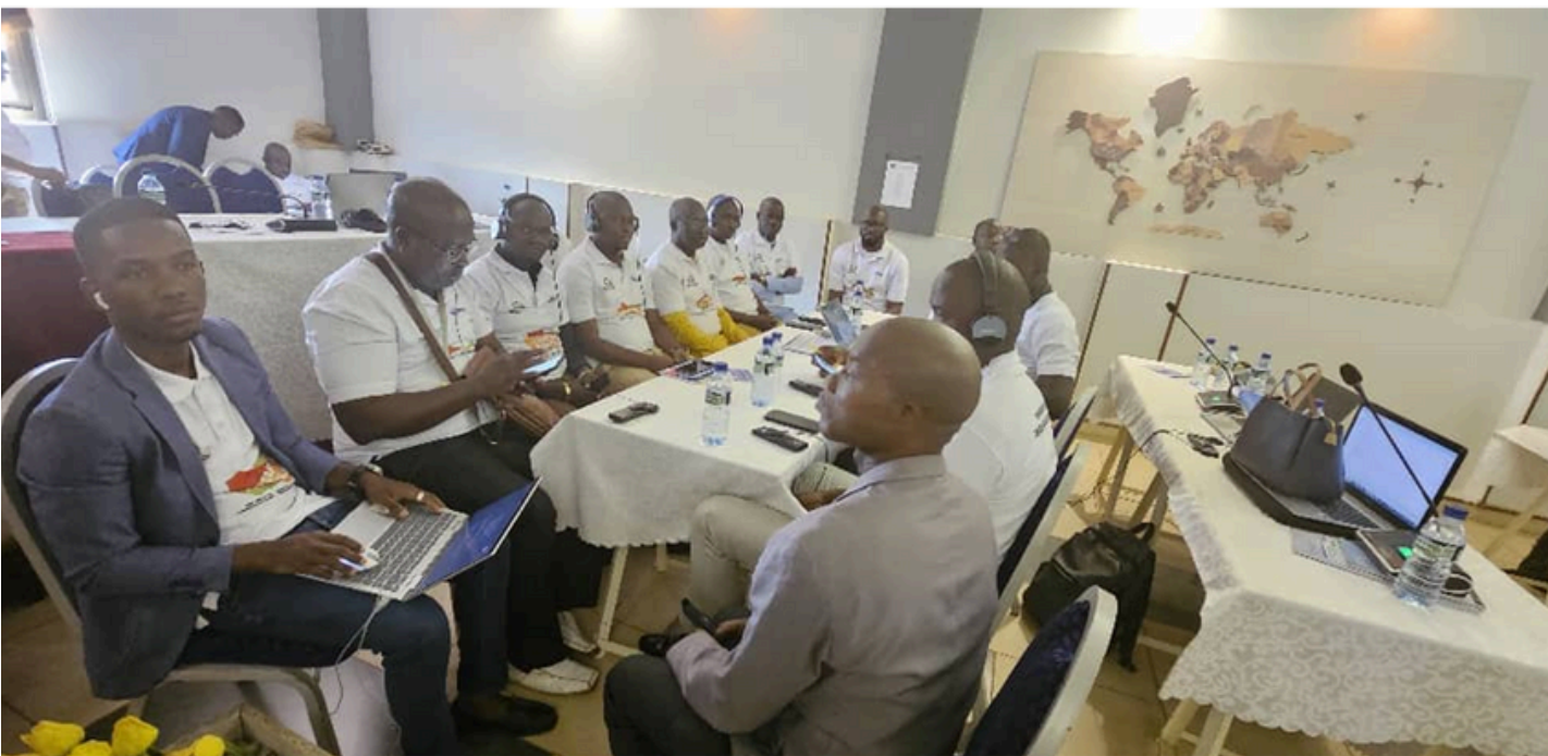
Photos from the training sessions