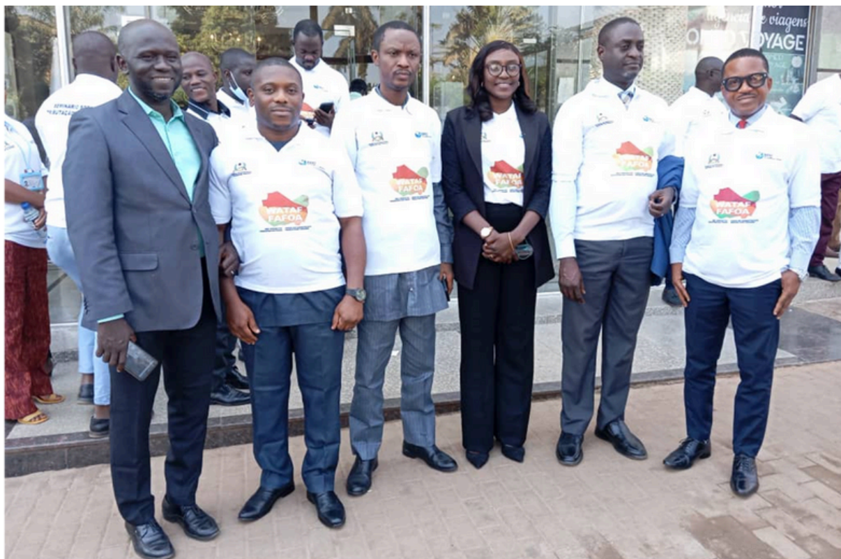
Guinea Bissau's Country Correspondent, the Trainers, and WATAF Staff

From 20-24 January 2025, Guinea-Bissau took a significant step toward improving domestic revenue mobilisation through a capacity-building workshop on Urban Property Tax, held at the Royal Bissau Hotel. The event was organised by the Directorate-General of Contributions and Taxes (DGCI) in collaboration with the West African Tax Administration Forum (WATAF) and was generously supported by the Open Society Foundation.