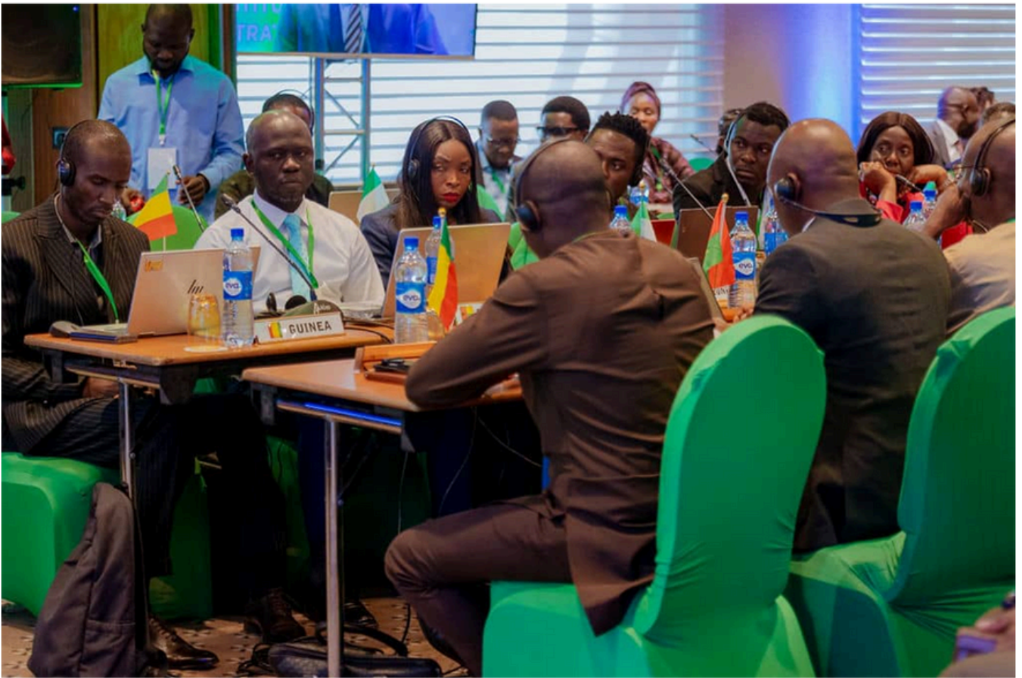
Panel discussions and speaker sessions from Day One