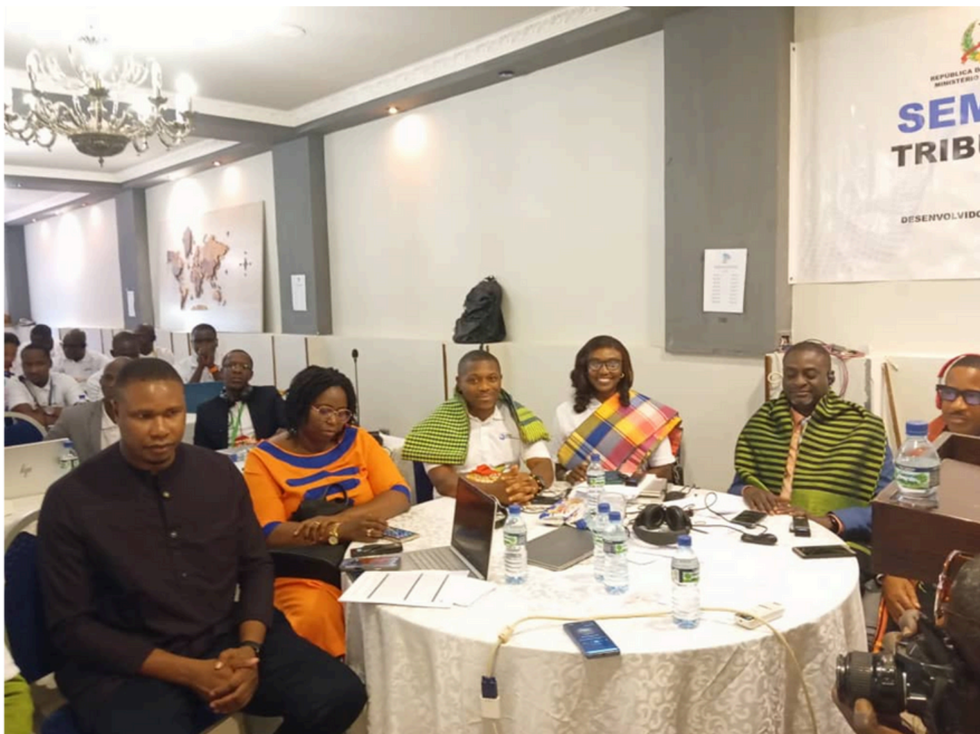
Photo from the closing ceremony, DG, DGCI, Trainers, and WATAF Staff

This workshop marks another step forward in Guinea-Bissau's journey toward a transparent, efficient, and equitable tax system. WATAF remains committed to supporting member states in building technical capacity and fostering regional cooperation in tax administration.