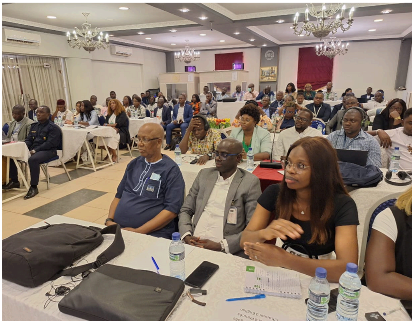
Above: Cross-section of DGCI staff during one of the training sessions.

Topics covered included VAT registration, invoicing, deductions, exemptions, and compliance obligations. Participants also reviewed practical aspects of tax audits, control measures, and cross-border considerations.