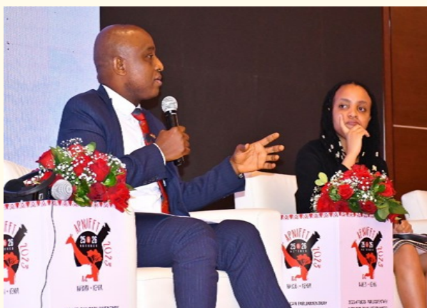
Oladapo speaking during the discussion

The success of the collaborative consultation underscores the significance of regional cooperation in effectively addressing the challenges and opportunities posed by the ever-evolving global tax issues.