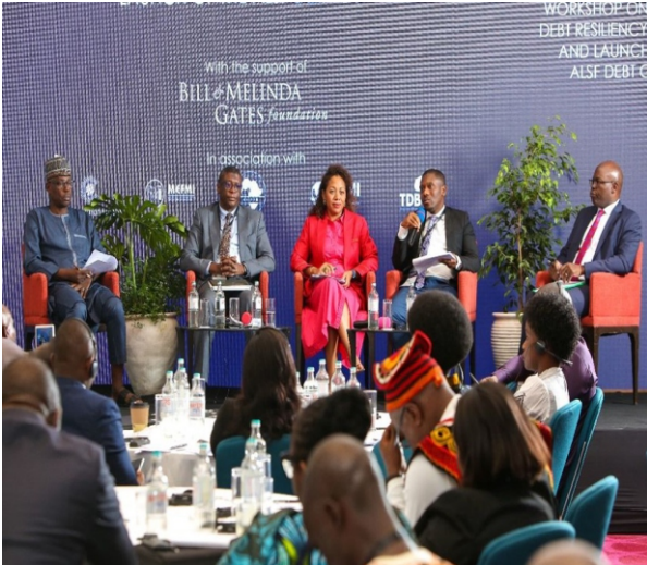
Debt Managers In Discussion

Debt managers gathered in Nairobi, Kenya, from November 13th to 17th, 2023, to marshal out debts recovery strategies in Africa.